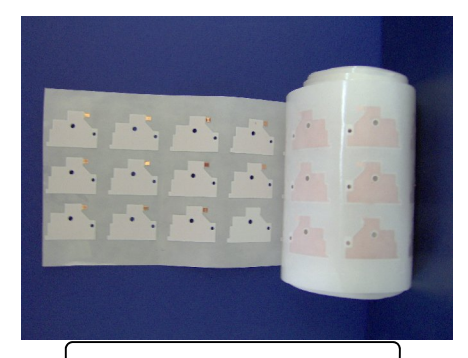
Roll of hand-held scanner parts